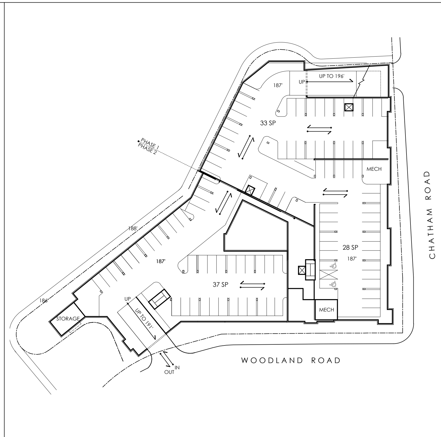
PLAN @ 187'