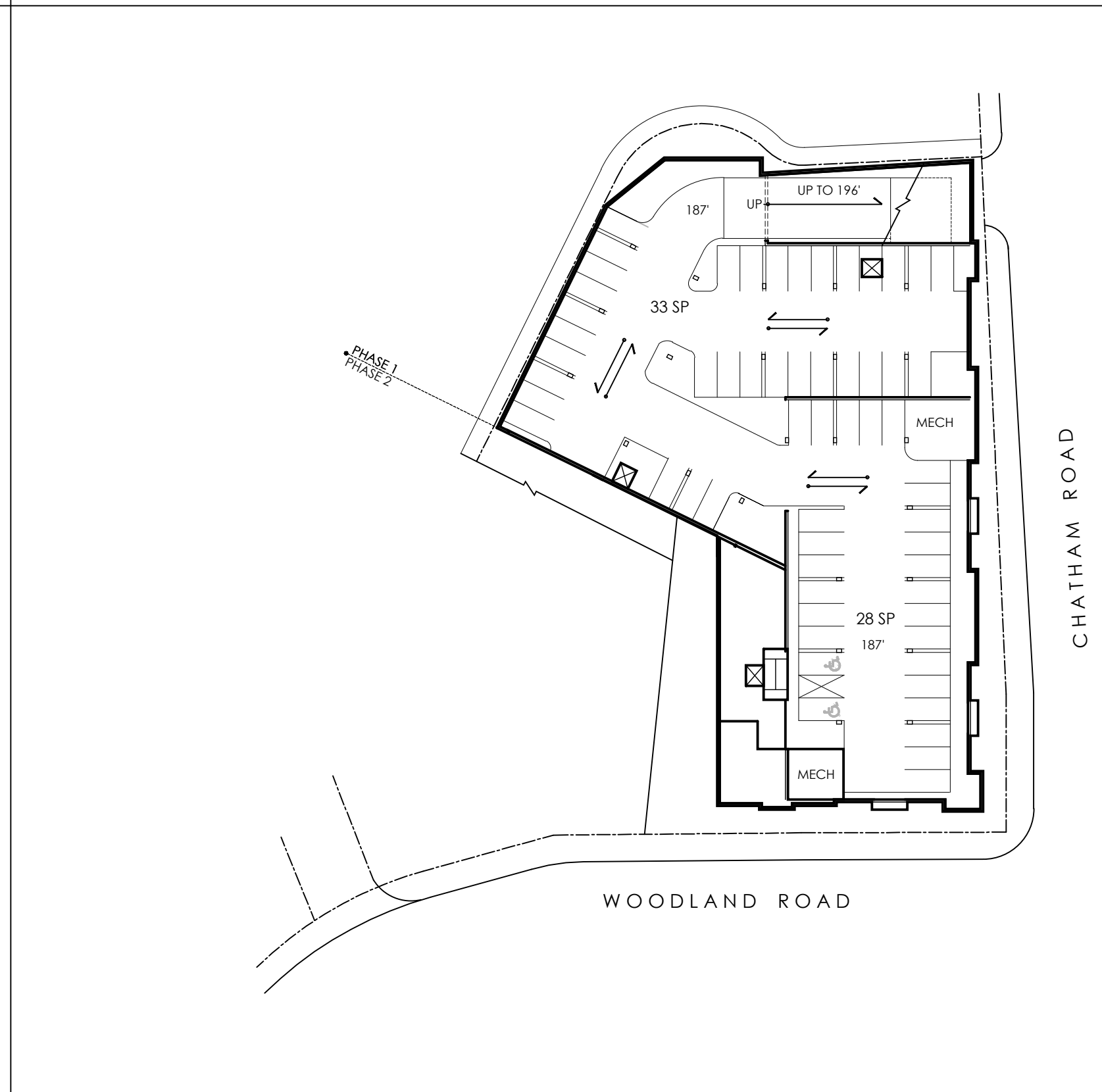
PLAN @ 187'