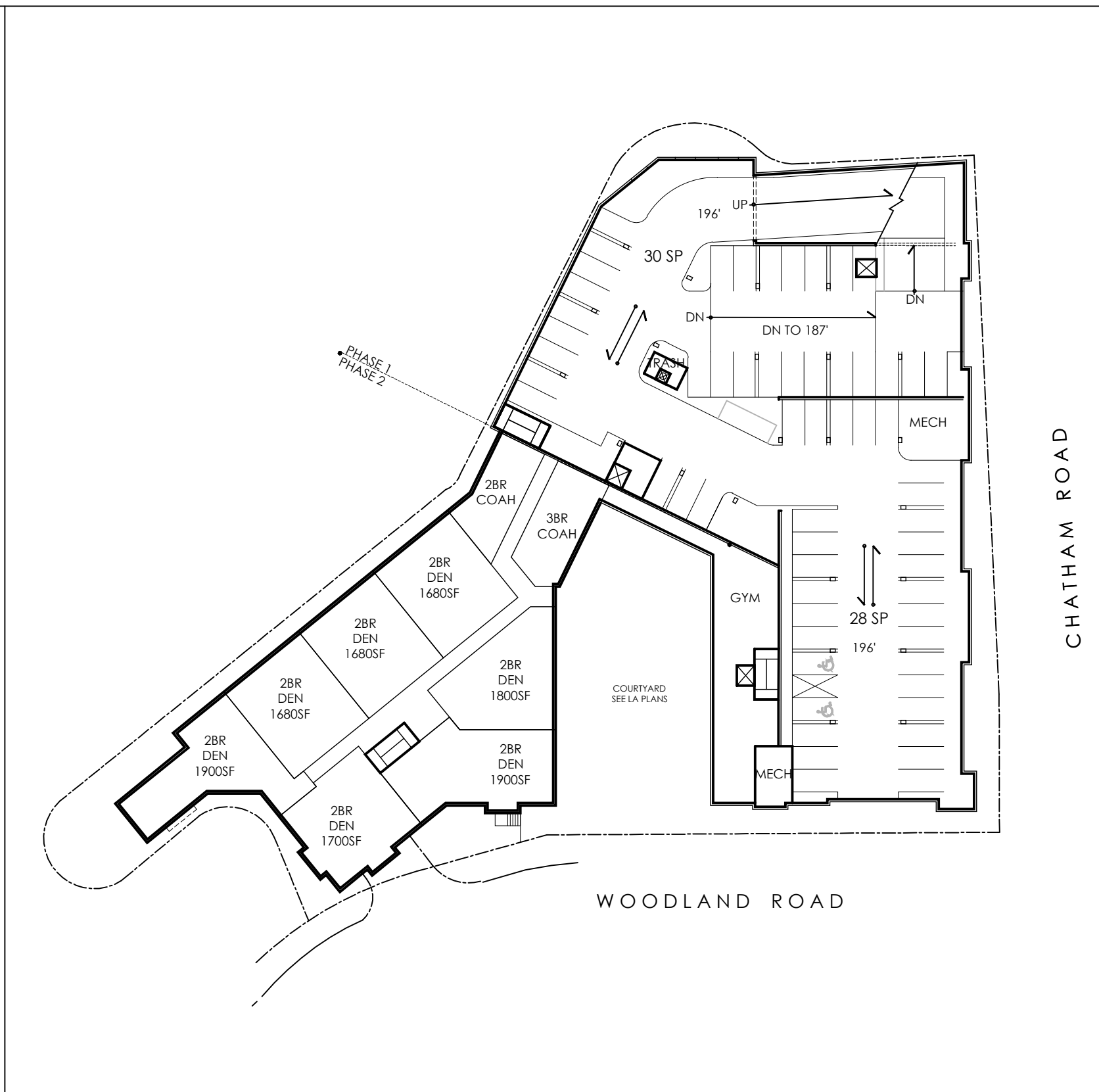
PLAN @ 196', 197'