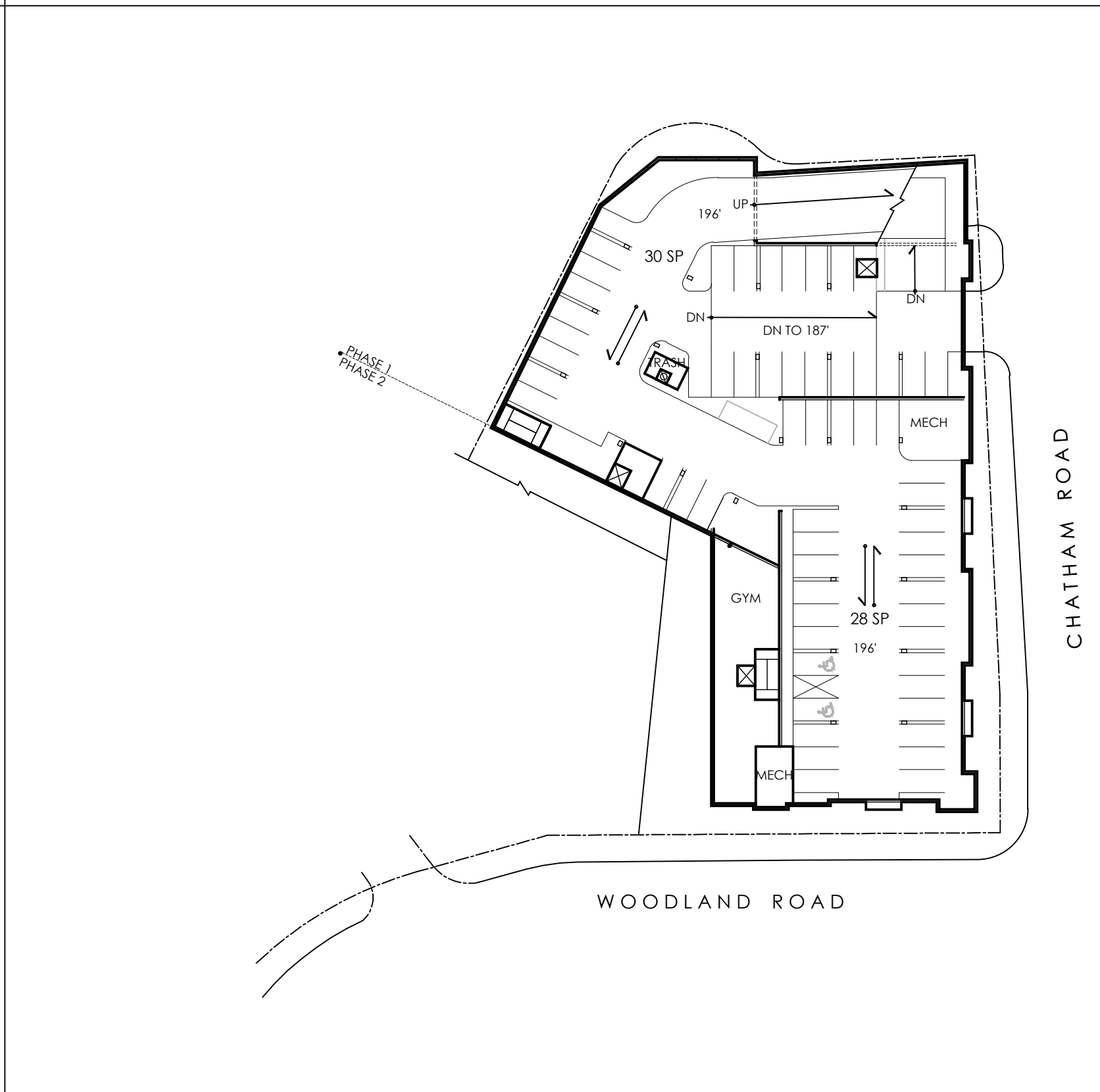
PLAN @ 196', 197'